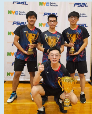
Badminton Doubles Championship

The High School for Dual Language and Asian Studies is the ONLY NYC Public High School with a Mandarin English dual language enrichment program. At the High School for Dual Language and Asian Studies, Chinese-speaking English Language Learners and English proficient students develop cross-cultural and linguistic competencies through thoughtfully-designed language and culture curricula while preparing for college and career. Students experience a comprehensive program with opportunities to participate in a variety of Advanced Placement (AP) classes, College Now courses and PSAL sports.