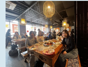
Immersive Cultural Experience