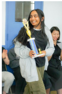
2024 National Chinese Speech Competition