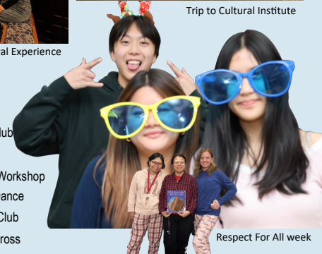
Respect For All week

Badminton Key Club Basketball K-Pop Book Clubs Lead Workshop Chess Club Lion Dance Chinese Support Math Club Chinese Yoyo Red Cross College & Career Prep Regents Prep Computer Literacy SAT Prep Crochet/Crafting Saturday Academy Dual Events Club SGA ENL Support Study Group Guitar Vision Sphere Homework Help Yearbook Club