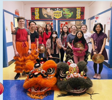
Lunar New Year Celebrations