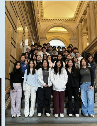
Trip to Cultural Institute