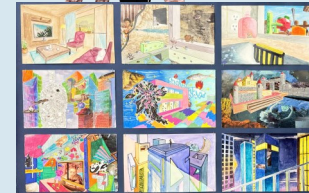
Cross Contour Drawing

All Students are encouraged to reach their maximum potential in all subject areas! 鼓励学生全面发展，尽展潜能！